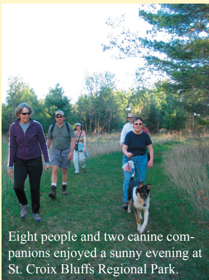
Eight people and two canine companions enjoyed a sunny evening at St. Croix Bluffs Regional Park.

The day dawned foggy, but by evening there was nothing but sun and blue sky as eight hikers and two dogs embarked on a leisurely tour of St. Croix Bluffs Regional Park in Denmark Township. Along the way we spotted several woodland flowers in bloom, including purple, white and yellow wood violets, merrybells and rue anemone. We also swapped advice on how to eradicate invasive buckthorn from yards and nearby parks. After making a three-mile loop along a wooded trail, we headed down to the boat landing to watch the fading light over the St. Croix River.