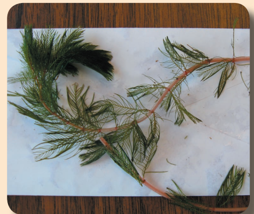
Recently Eurasian watermilfoil, an invasive aquatic plant, was found in Stillwater's Long Lake. (above)